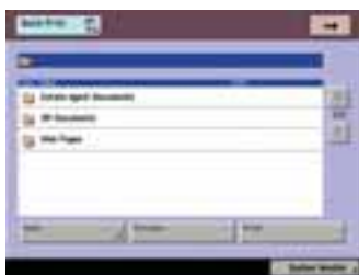
Quick Print Panel